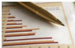
Studien & Publikationen